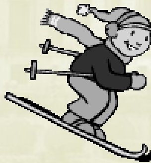
A new year of new snow for the Ski and Snowboarding Club!

“Ski club is a chance for kids to try something new,” ac-